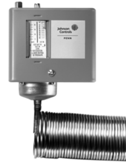
A70GA-1 Temperature Control